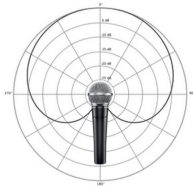
Shure SM58 Overlaid On A Cardioid Polar Response Graph